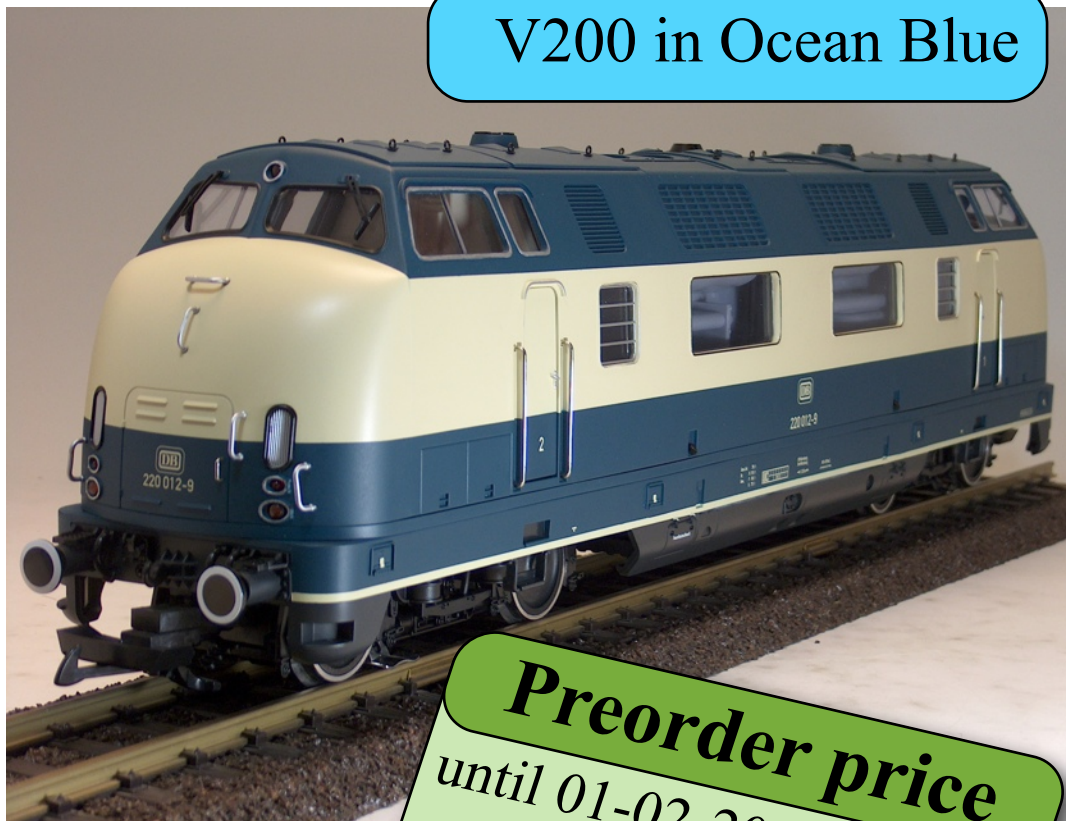
V200 in Ocean Blue

In this work we use only the highest quality materials to provide a perfect as possible model.